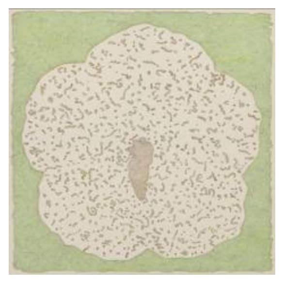
Untitled 2009 acrylic on canvas 96.5 x 96.5cm

Use of images must clearly credit the artist and other relevant parties.