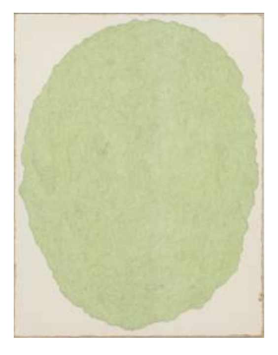
Untitled 2009 Acrylic on canvas 112 x 145.5 cm