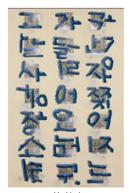
Untitled 1994~1995 acrylic on canvas 299 x 147 cm