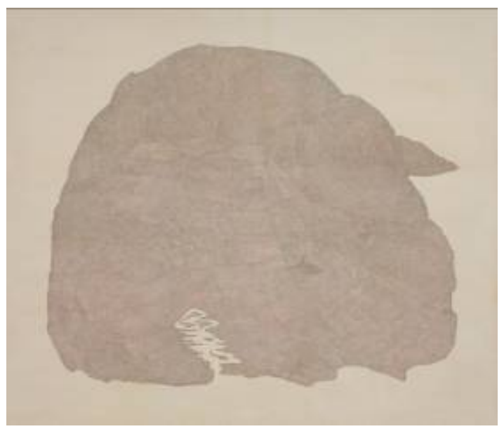
Untitled 2007 acrylic on canvas 201 x 236 cm

Use of images must clearly credit the artist and other relevant parties.