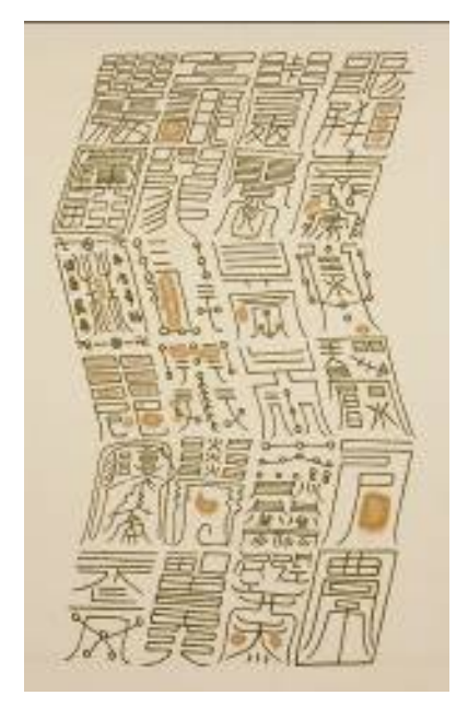
Untitled 1994~1995 acrylic on canvas 229 x 147 cm

Use of images must clearly credit the artist and other relevant parties.