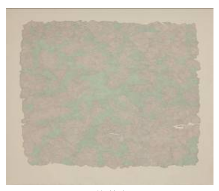
Untitled 2008 acrylic on canvas 201 x 236 cm