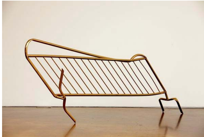
Untitled (barricade) 2010 24 kt gold plated barricade “Courtesy of Kukje Gallery, Inc.,”

Use of images must clearly credit the artist and other relevant parties.