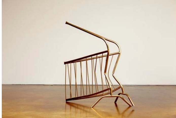
Untitled (barricade) 2010 24 kt gold plated barricade

Use of images must clearly credit the artist and other relevant parties.