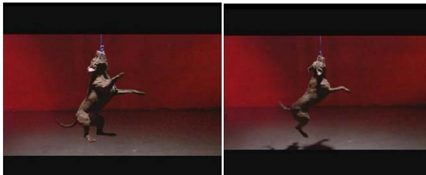
Good Boy 2001 Video Edition 4 / 5, 1 AP