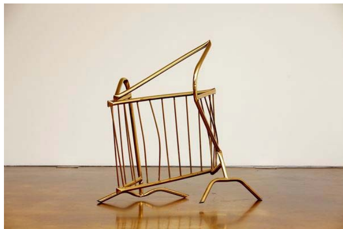
Untitled (barricade) 2010 24 kt gold plated barricade “Courtesy of Kukje Gallery, Inc.,”