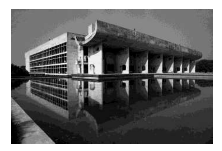
Palace of Assembly, Chandigarh, India. 2008

As a celebrated architect and designer, Pierre Jeanneret pursued a progressive architectural philosophy that integrated design into everyday living. His ideas were practical yet driven by a refined aesthetic, and he expanded the boundaries of design in the 20th century, moving it beyond the privileged classes and improving peoples' standards of living through innovation. Jeanneret is best known for his more than fifty-year collaboration with his cousin, the architect Le Corbusier, and their numerous high profile architectural projects such as Villa Savoye (1929), and the Pavillon Suisse of Cité Internationale Universitaire in Paris (1932-33).