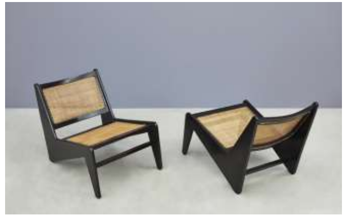
"Kangaroo" Chairs, ca. 1955, 58.5(H) x 55(L) x 67(D) cm