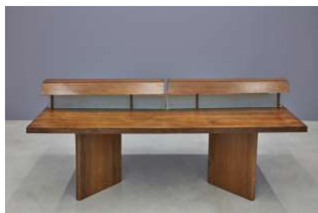
"Library Table", ca. 1960, 108(H) x 243.8(L) x 121(D) cm

For the Chandigarh project, the architects aimed to incorporate modernist philosophy in both the design of the city as well as every aspect of its day-to-day functions, including, most notably, all of the furniture and interior design. They hoped to create a plan that both balanced India's unique culture and climate conditions, and the demands for a vibrant civic and administrative center. With this as a framework, they modeled their design on the proportions of the golden ratio and Le Corbusier's "Modulor" theory, which sought to create an innovative ergonomic relationship between architecture and the human body.