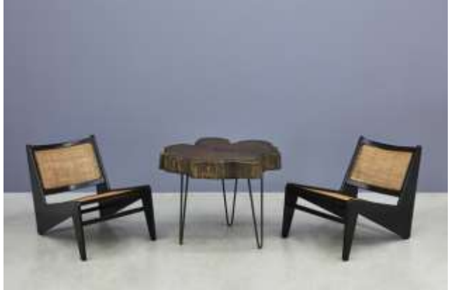
"Tree Trunk" Coffee Table and "Kangaroo" Chairs

as one of distinctive Indian heritage. Combining strong minimal forms and simple materials such as wood, cane, and steel, Jeanneret's designs integrated modern ideals with the rural spirit of the Indian craftsman's work, a mélange that can be seen most strikingly in the exquisite use of local teak and rosewood. Specific engineering solutions and formal attributes in the furnishings, for example in the "Library Table" and "Kangaroo Chairs", share an instantly recognizable geometric language. Often utilizing the basic shapes of "x" "u" and "v", these forms can be seen clearly in the support structures and legs of these iconic works. Pierre Jeanneret's simple designs and use of modest materials made it possible to mass-produce the pieces, and people, no matter of their social standing, were able to use the furniture easily and conveniently. This generous spirit continues to characterize the pieces today, and they have become one of the most iconic designs of the 20th century.