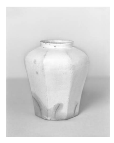
OSK 15 BW 2005 Archival pigment print 106 x 85 cm

Use of images must clearly credit the artist and Kukje Gallery