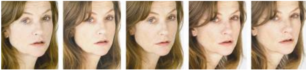
Portrait of an Image (with Isabelle Huppert)