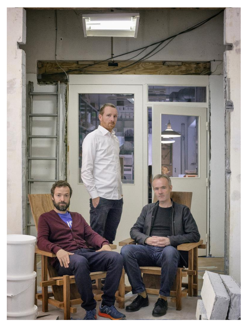
Portrait of SUPERFLEX