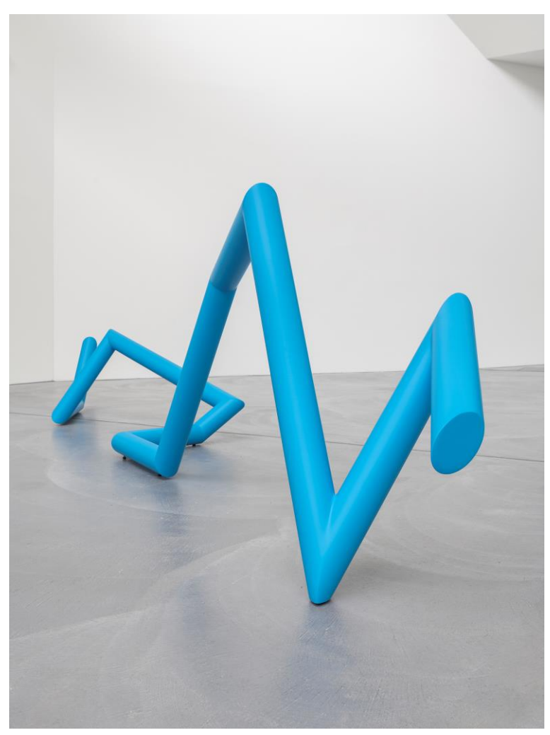
SUPERFLEX Connect With Me 2018 Steel tubes, polyurethane enamel paint 423 x 75 x 86 cm