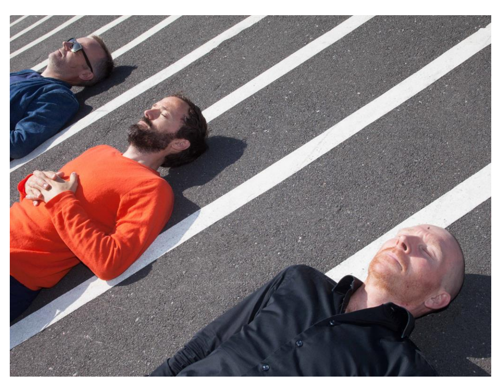
Portrait of SUPERFLEX