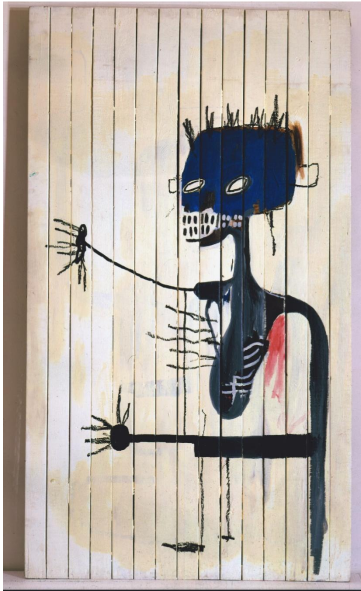
Jean-Michel Basquiat (American, 1960-1988)

Use of images must clearly credit the artist and other relevant parties, and image editing cannot be performed without prior permission.