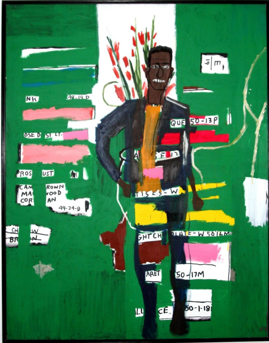
Jean-Michel Basquiat (American, 1960-1988)

Use of images must clearly credit the artist and other relevant parties, and image editing cannot be performed without prior permission.