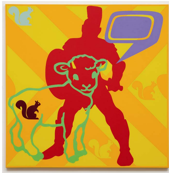
19988888 2009 Acrylic on canvas 158 x 158 cm

Use of images must clearly credit the artist and other relevant parties.