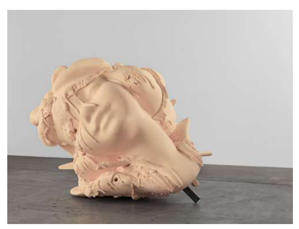
White Snow Head 2012 Silicone (flesh), fibreglass, steel 140 \times 160 \times 185 cm